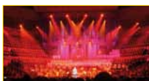
The Night of 1000 Voices®