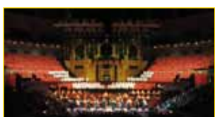
The Night of 1000 Voices®