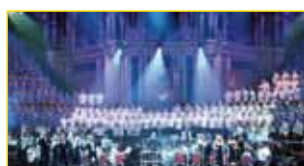
The Night of 1000 Voices®